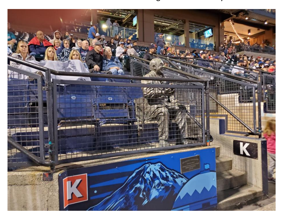
A statue of Ben Cheney sitting in the seats from the old Seals Stadium in San Francisco remain today.