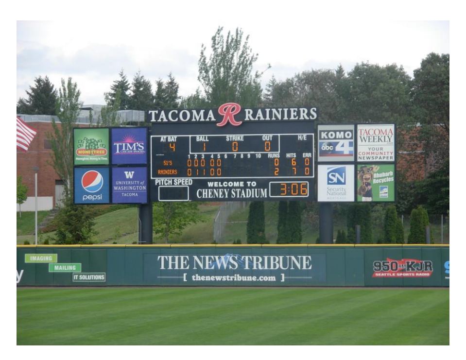
Cheney Stadium Scoreboard.