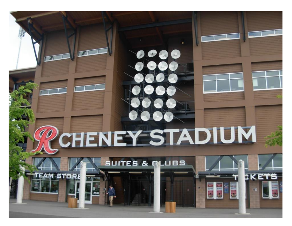
Home Plate (Main) Entrance after the 2010 renovation