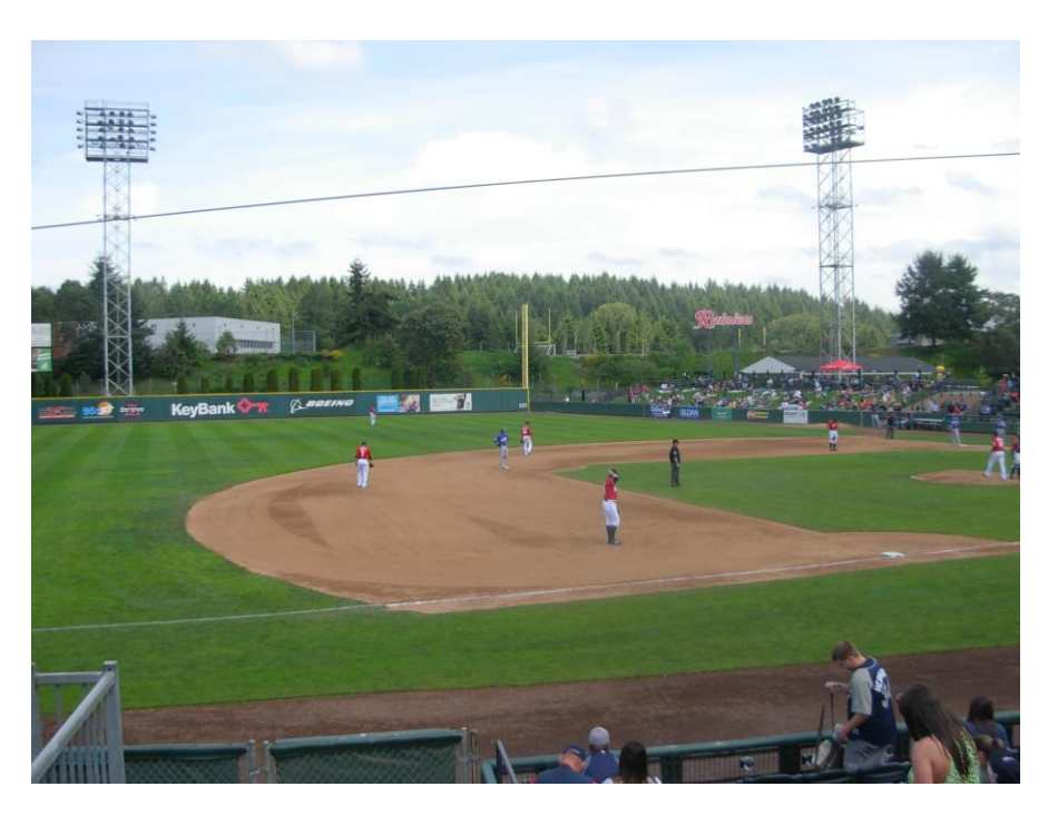
View from the third base side. The evening sun sets behind you in this area.